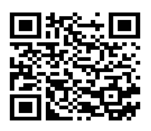
Copyright: © 2023 The Authors. Published by Publisher. This is an open access article under the CC BY-NC-ND license (https://creativecommons.org/licenses/by-nc-nd/4.0/).

<sup>2</sup>Graduate School of Business and Advanced Technology Management, Assumption University of Thailand