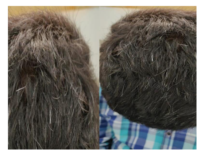
Figure 01: Grey hair pics collected from one of the subjects.

study. A questionnaire on characteristics and associated factors of hair graying was filled in the face-to-face interview method.